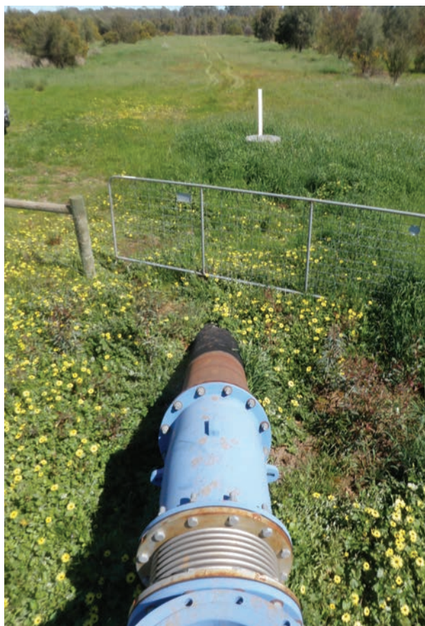
Above ground section of Rockland water pipeline leading to buried section, showing land access and use restored.

Broader news and information about the Wimmera Project is available online at www.iluka.com/engage/wimmera .