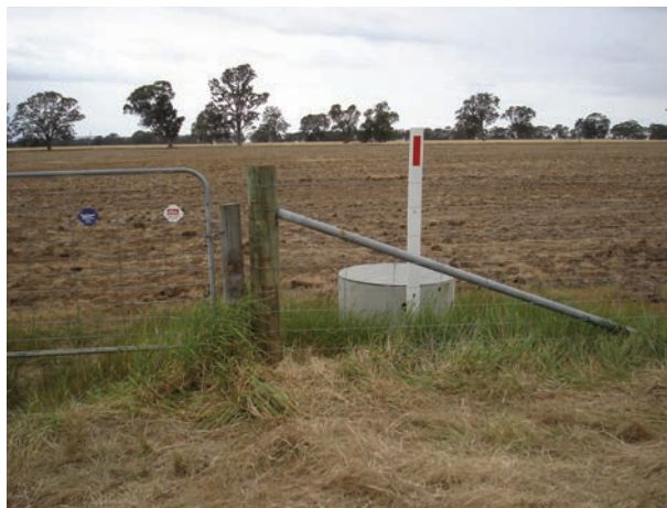
Air valve inspection point and marker showing location of buried water pipe.