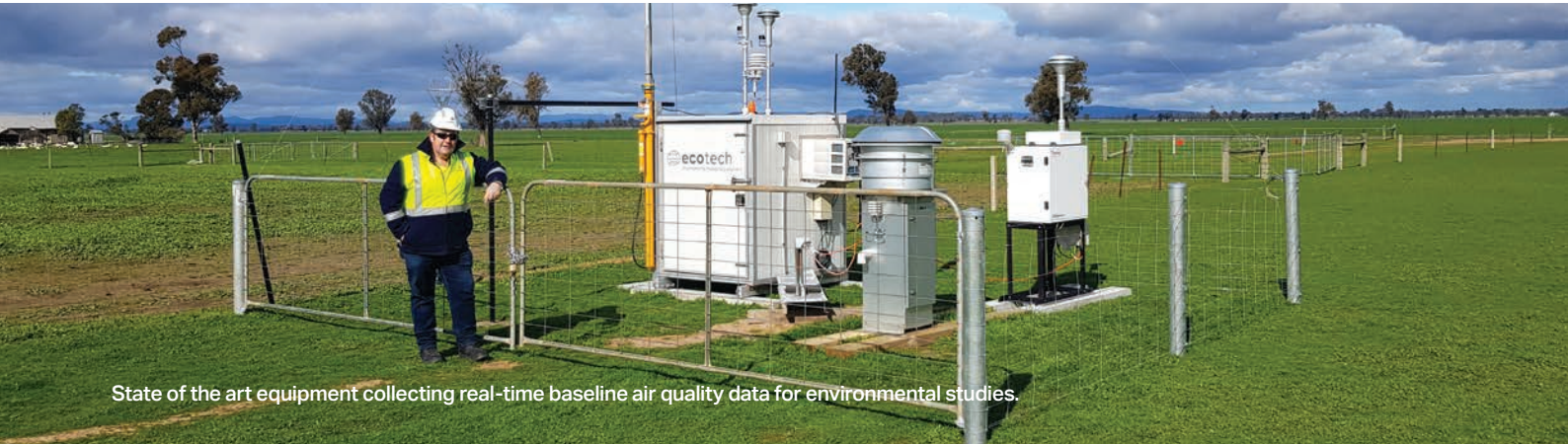
State of the art equipment collecting real-time baseline air quality data for environmental studies.