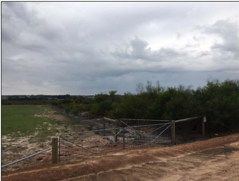
Plate 2: Roberts Block Vegetation Link