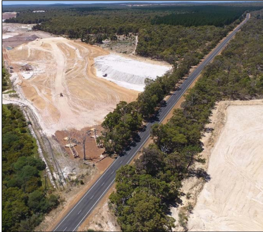
Plate 1: State Forest along eastern boundary of operations (Feb 2018)