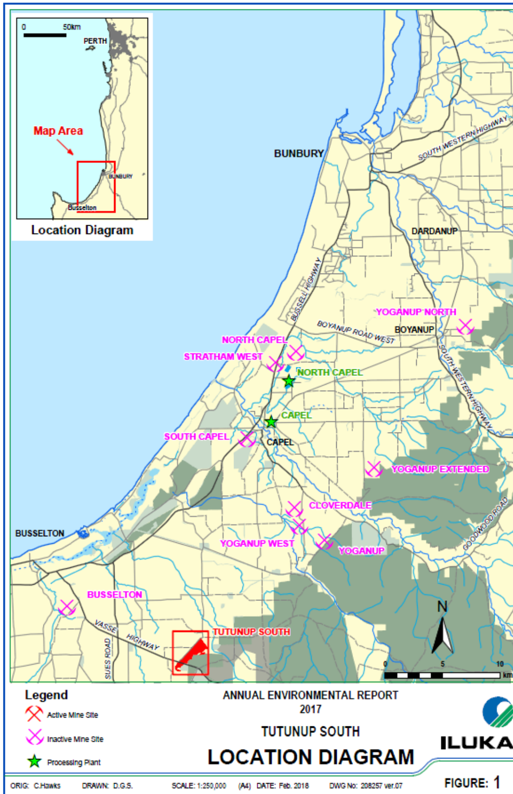
Figure 1: Tutunup South Location