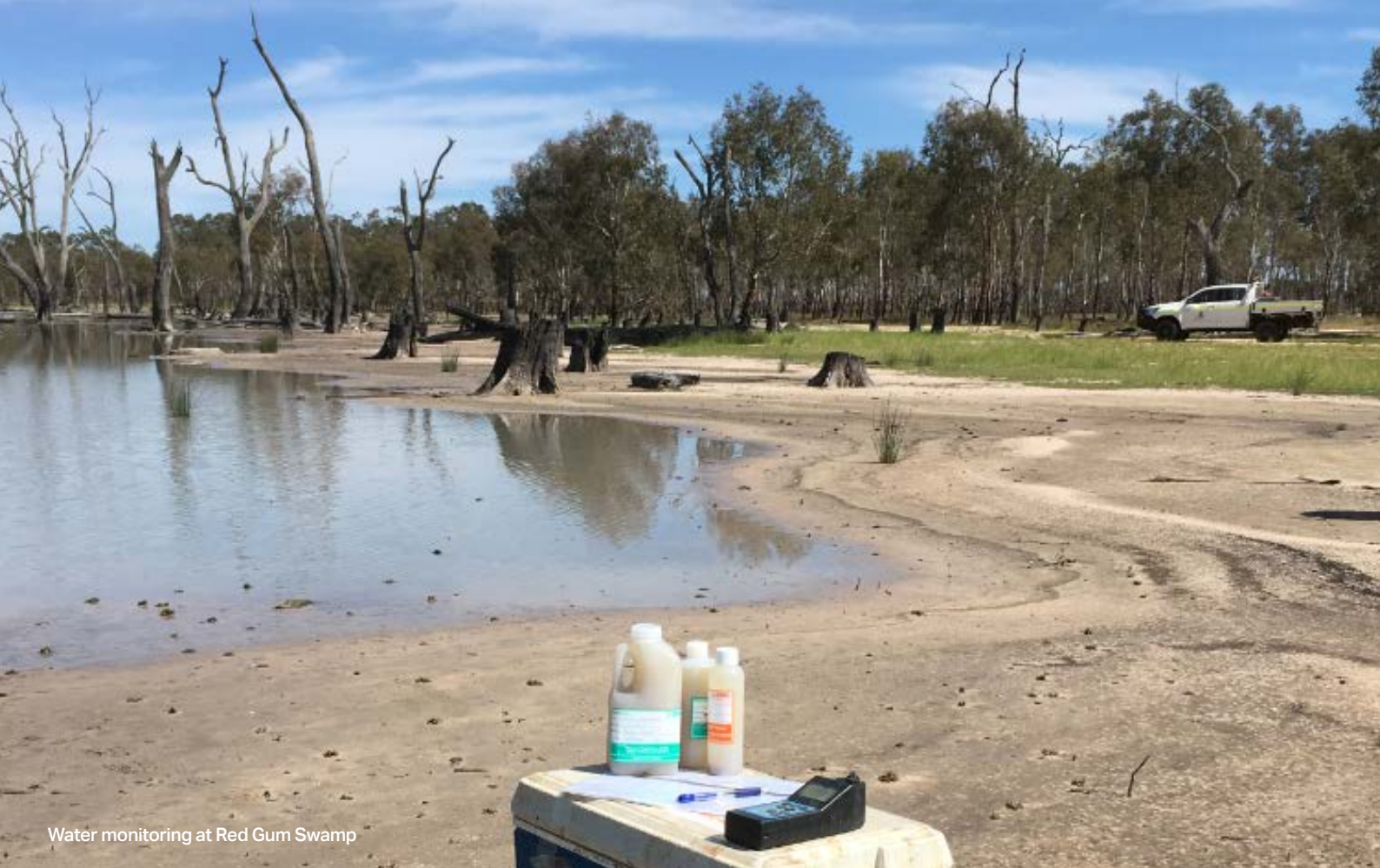
Water monitoring at Red Gum Swamp