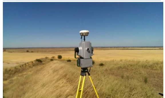
Laser scanner (above); laser scans overlaid with aerial photography showing infrastructure mapping at Eneabba, Western Australia (left)