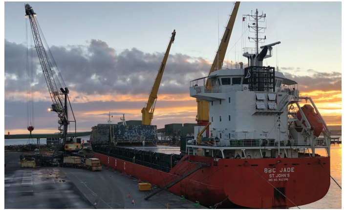
Loading begins for first mineral sands concentrate export in June.

"Ultimately, the most critical factor is team work by vigilant and highly-skilled people across a range of varied roles."