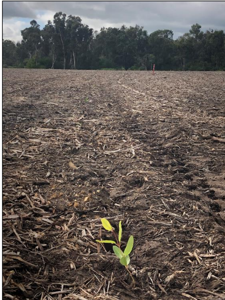
Plate 3 – Mulched Surface of the WRP Offset Area