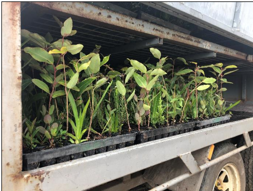
Plate 4 – WRP Offset Area Tubestock