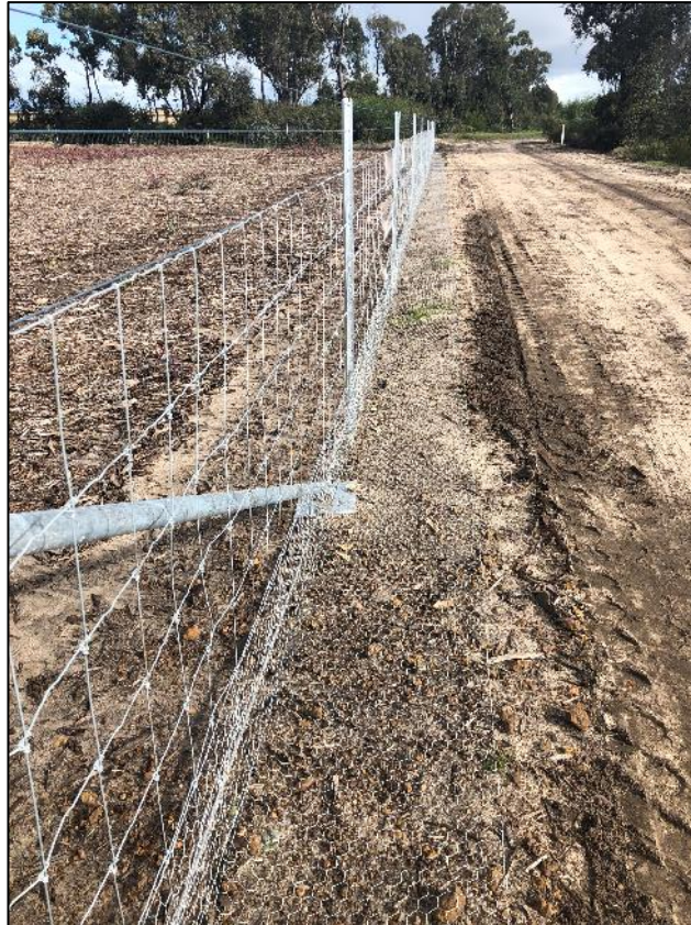
Plate 1 – WRP Offset Area Perimeter Fence