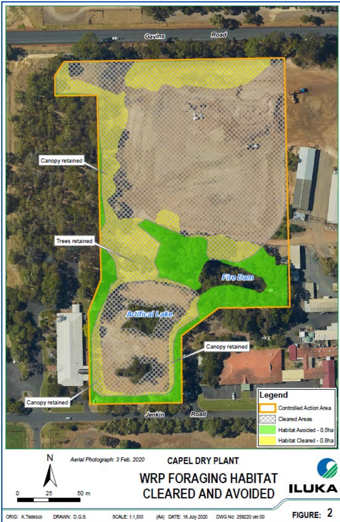
Figure 2 – Capel Dry Plant WRP Disturbance Area