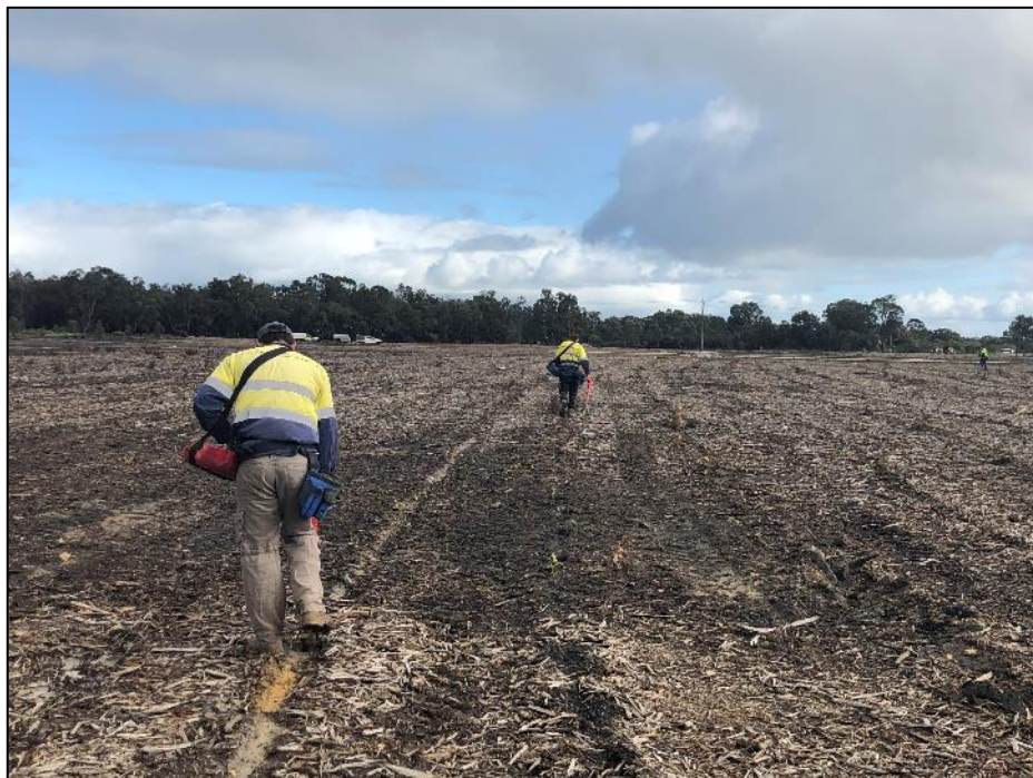
Plate 2 – Tubestock Planted Along Rip Lines