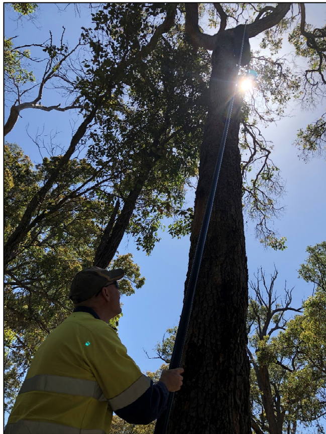
Plate 3: Inspection of artificial nest hollow