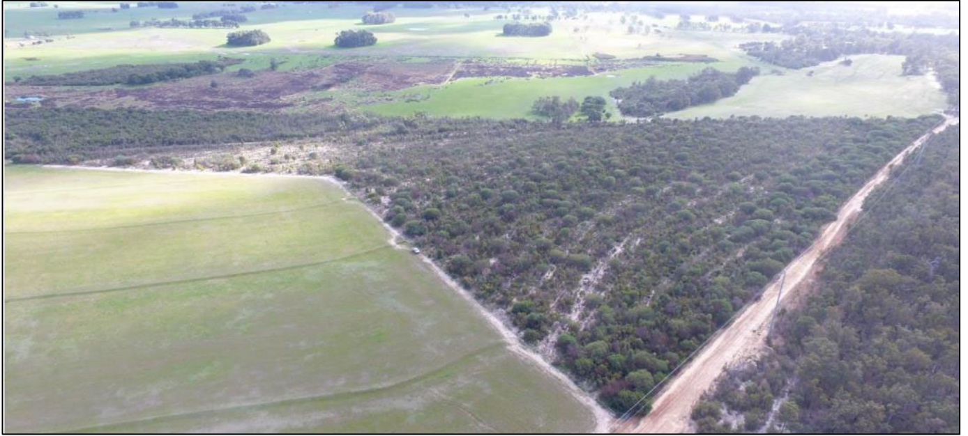
Plate 2: Roberts Block and Vegetation Link May 2020