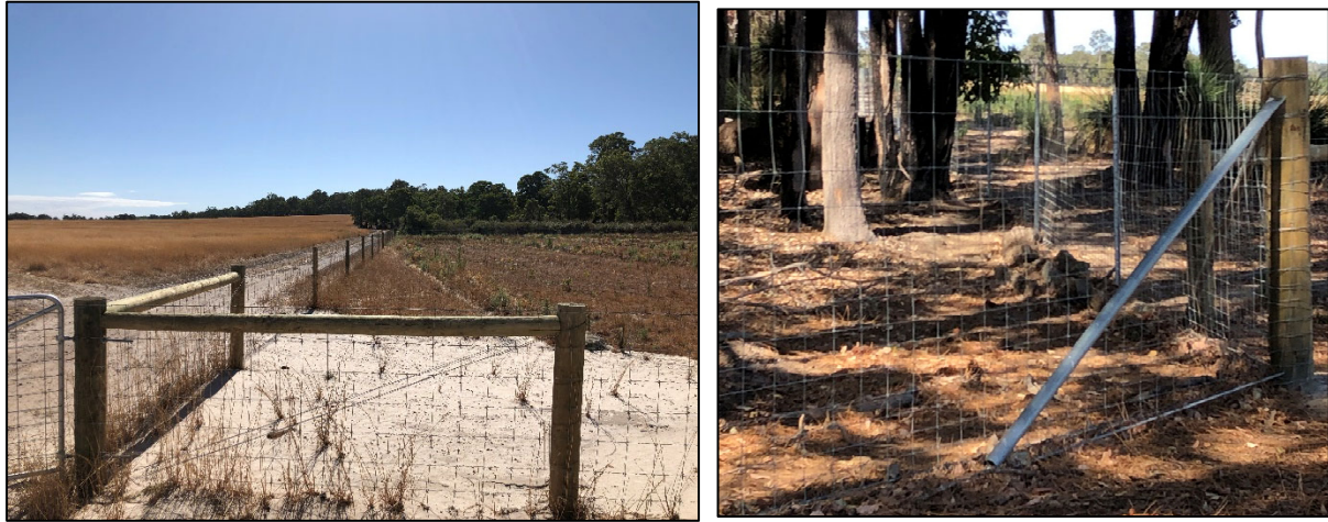
Plate 4: Internal Stock Fence (left) and 1.5m Boundary Fence (right)