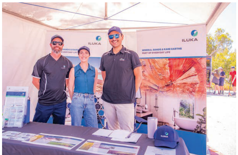
The Iluka team at Captivate Capel in March

i To find out more about Iluka's projects, you can reach us at: