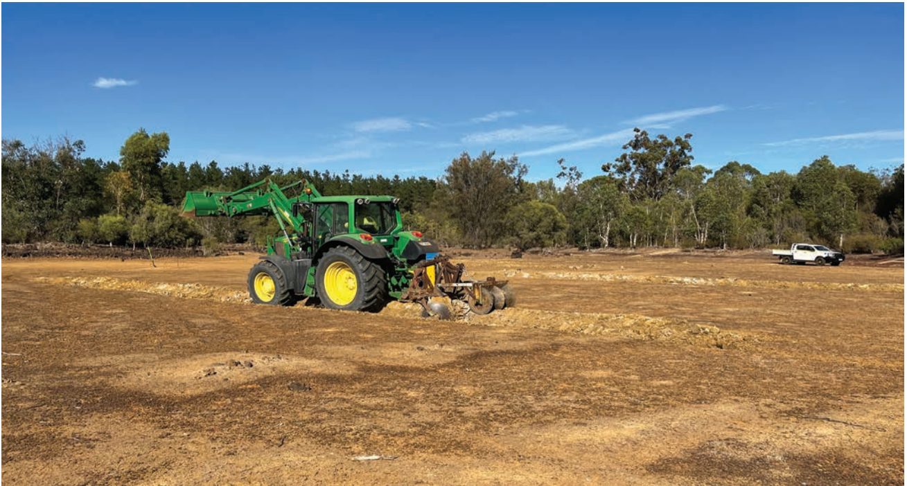
Creating artificial pools in dry lake beds within the Capel Wetlands