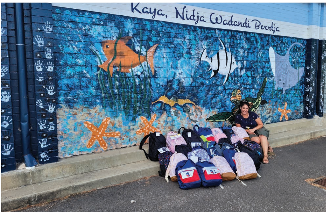
Supporting Dandelions WA's backpack donation to West Busselton Primary School

For more information on Dandelions WA, visit www.dandelionswa.org.au