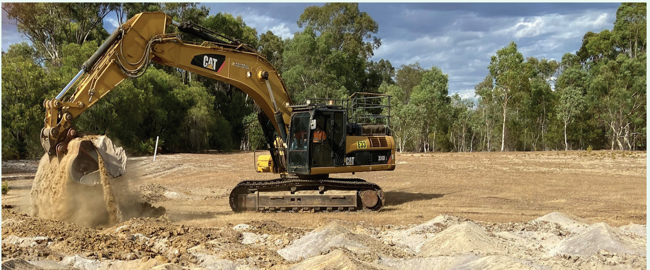
Specialised digging mixer method used to mix clay deep into sandy soil for soil improvement trial to support vegetation growth

Iluka will continue to monitor the progress of the vegetation growth in these areas.