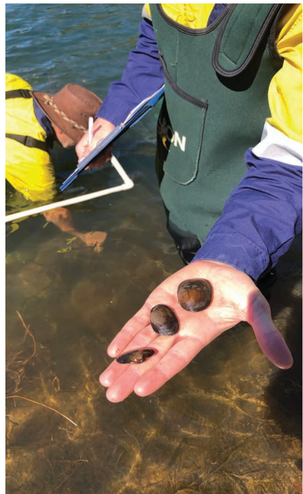
Conducting research on species found within the Capel Wetlands, including Southwestern snake-necked turtle and Carter's freshwater mussel